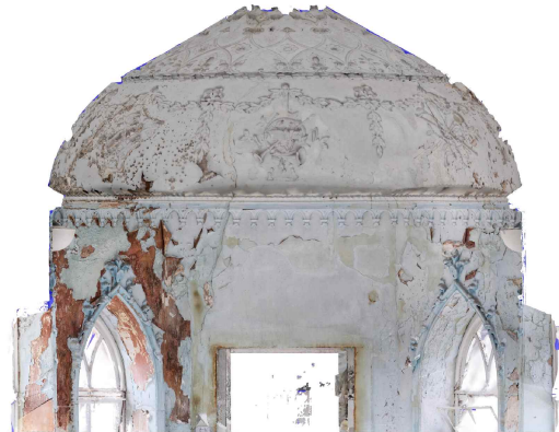
INTERNAL ELEVATION RE4

This drawing is the copyright of Oliver Architecture Ltd. All dimensions are to be checked on site prior to commencing work. Scaled dimensions should not be taken from this drawing unless stated. Dimensions of new work are to be adjusted to suit the existing building as necessary. The contractor must not assume that the existing building is plumb, square or level. Prior to commencing work, all discrepancies are to be reported to the Architect.