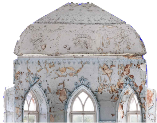
INTERNAL ELEVATION RE2