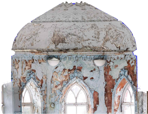
INTERNAL ELEVATION RE3