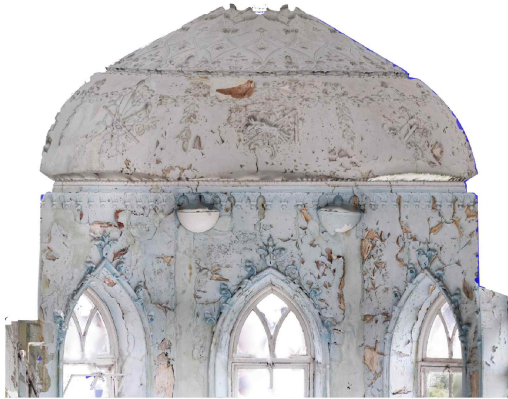
INTERNAL ELEVATION RE1